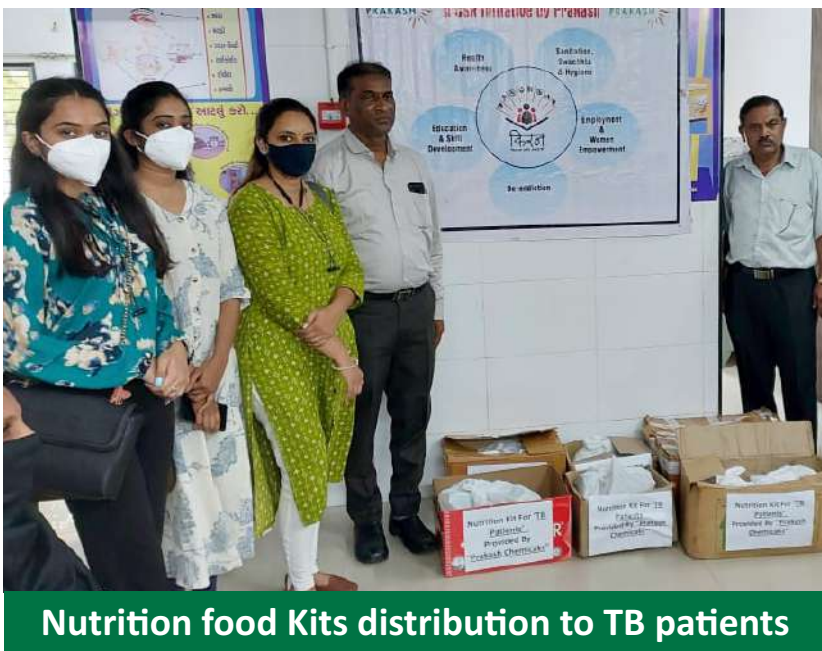
Nutrition food Kits distribution to TB patients