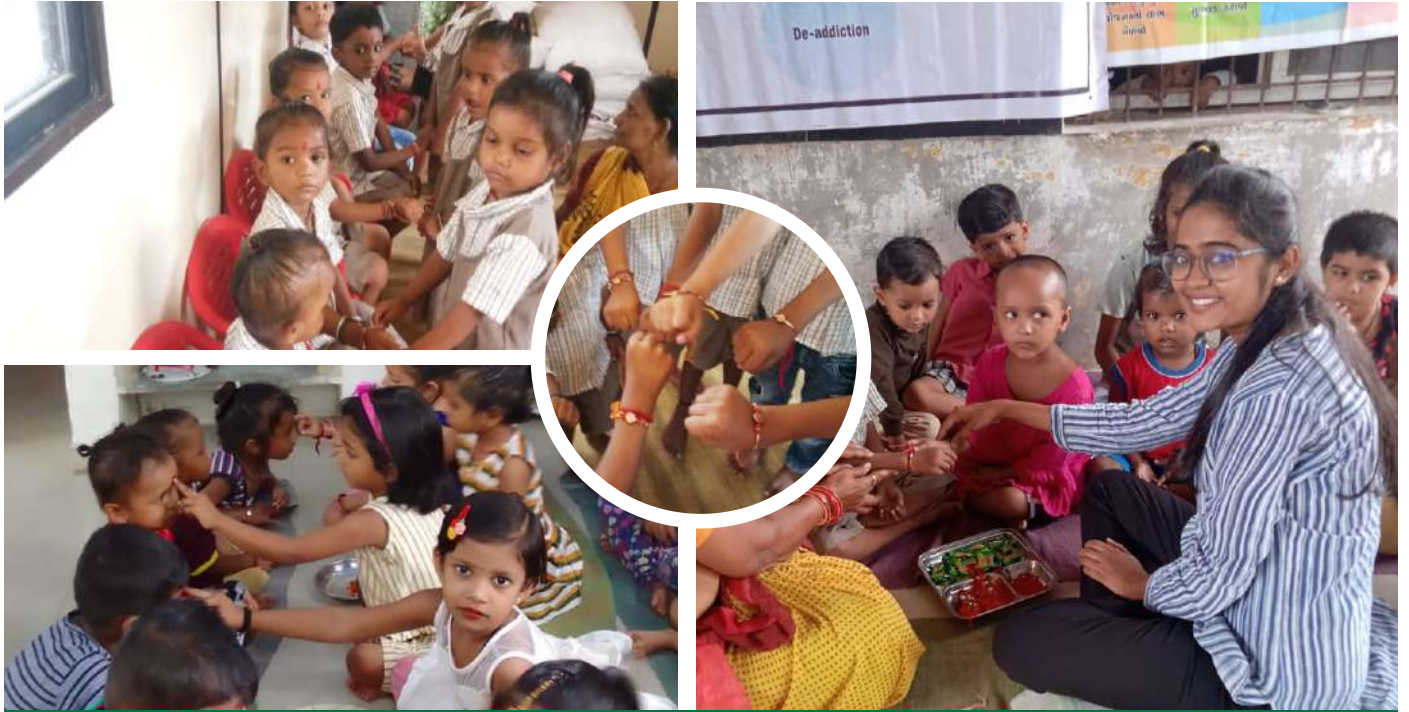
Raksha Bandhan celebration at our adopted Anganwadis